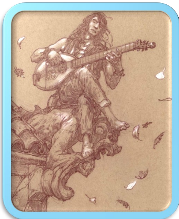
Kvothe Gargoyle-cropped by Donato Giancarlo

https://seattlein2025.org/location/hotels-accommodations/room-parties/ or email parties@seattlein2025.org .