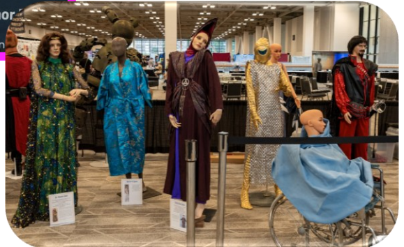
The costume exhibit, early days- and Aug 13 Exhibition Hall - Costume Manikins

The Daily 'Zine and Nightly 'Zine are the news sheets for Seattle Worldcon 2025. The 'Zines are published as a morning edition released at 9 a.m. and an evening edition released at 2 p.m. Info blurbs and photos from you, the convention members, are welcome and encouraged. The deadline is 10 p.m. for the next day's edition and 11:59 p.m. for the next evening's edition. Email your photos and submissions to zine@seattlein2025.org .