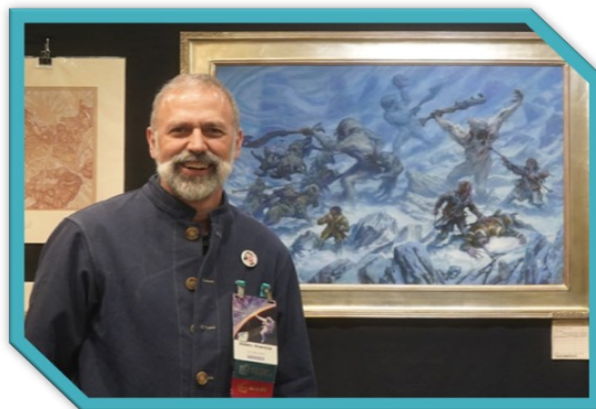
Aug 14 GOH Artist Donato Giancola by Zoe Cai