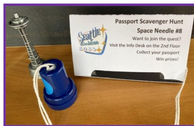
Aug 14 Space Needle Scavenger Hunt by Sabrina Nelson

If you want to publish your party, add it to the board, fill out the form on https://seattlein2025.org/location/hotels-accommodations/room-parties/ or email parties@seattlein2025.org .